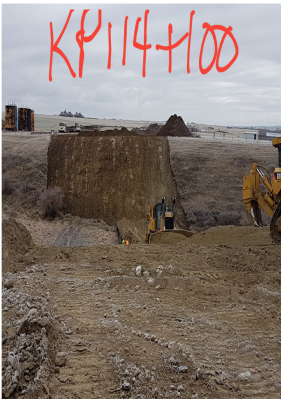
11. Stripping activities at Km 114+100 – Oct 14, 2017