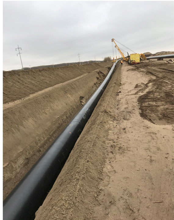
8. Pipe laying at km21+225 – Oct 11, 2017