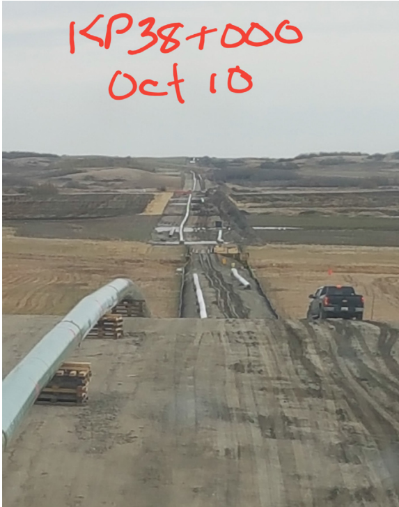
1. View of water on ROW at Km38+600 – Oct 10, 2017