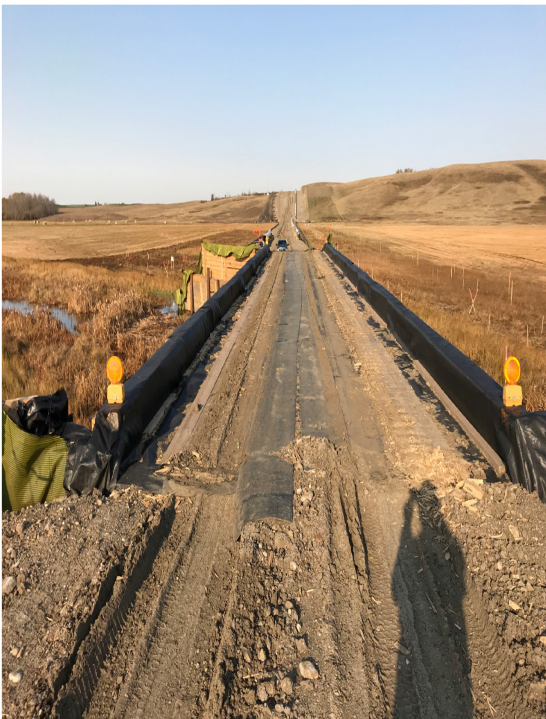
7. Marshlands and Bridge at Km 38+600 – Oct 11, 2017