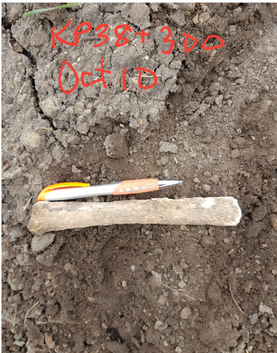
3. Bone identified at location Km38+300 – Oct 10, 2017