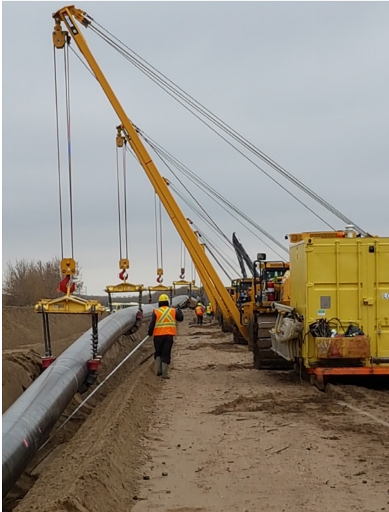
5. Booms at Km 21+300 – Oct 11, 2017