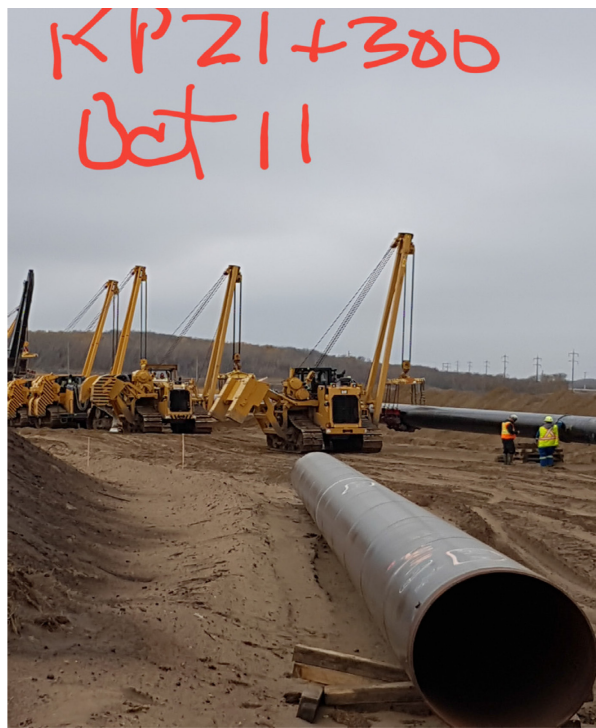
4. Booms at location Km21+300 – Oct 11, 2017