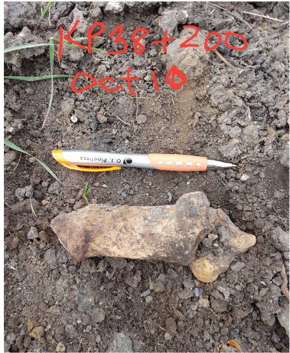
2. Bone at Location Km38+200 – Oct 10, 2017