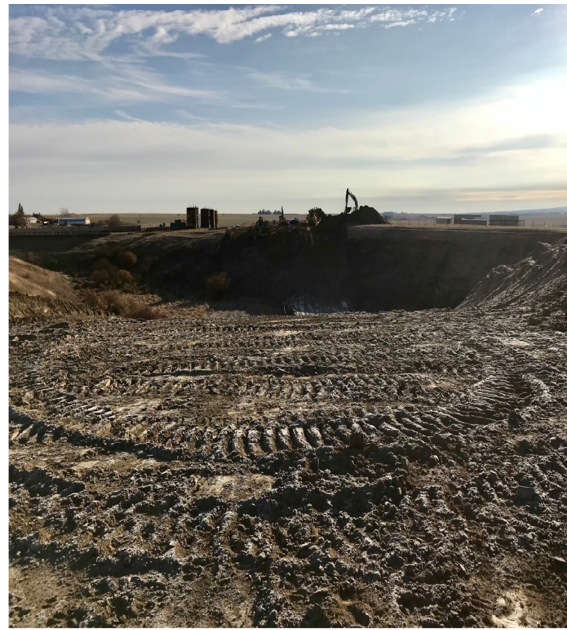
10. Ravine Stripping at 114+100 – Oct 14, 2017