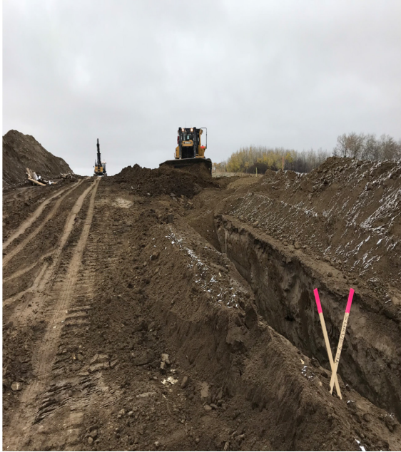
9. Dozer filling in ditch at km20+650 – Oct 12, 2017