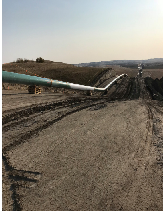
6. East at location 37km+875 – Oct 11, 2017